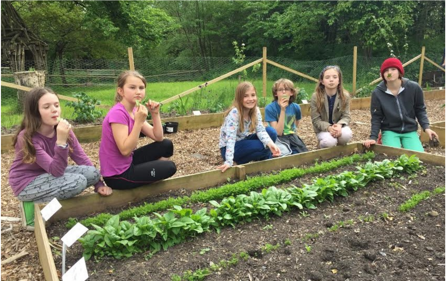
Growing, preparing, serving and selling food at Bedales School