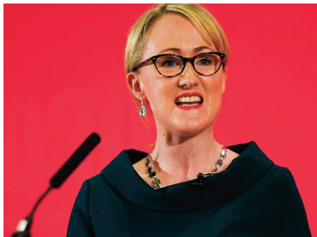
Rebecca Long Bailey MP

For those in education, be that children, university students or apprentices, the future may seem unsure at the moment as our whole world is put on pause. But one thing we know for sure is that our education sector and all those who work in it, from teachers to support staff, have risen to the challenge spectacularly. Teaching staff across the country have kept children's education going whilst they are at home and schools have provided a vital service to vulnerable children and the children of key workers.